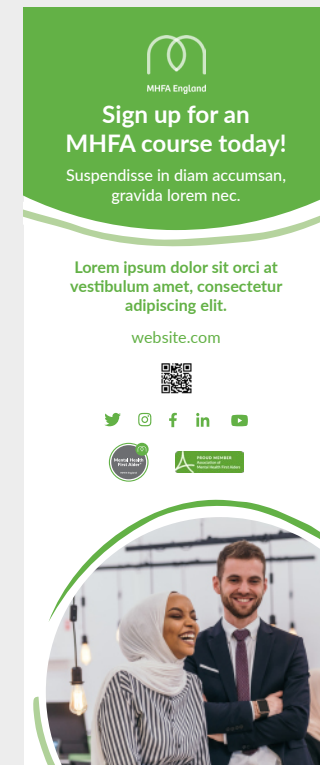
Roller banner displaying member badge